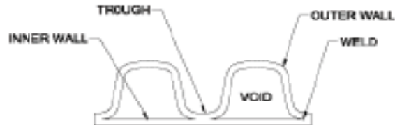
FIGURE A - WALL PROFILE

A schematic of the wall profile is shown in Figure A and significant dimensions are given in Table 3.